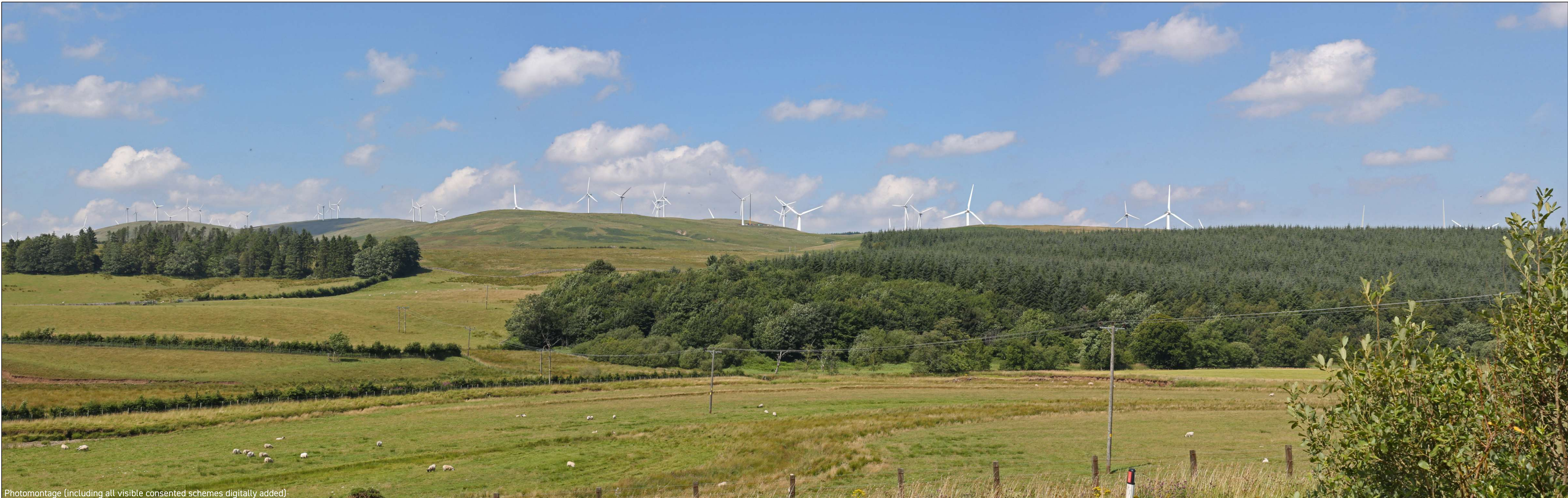
Photomontage (including all visible consented schemes digitally added)