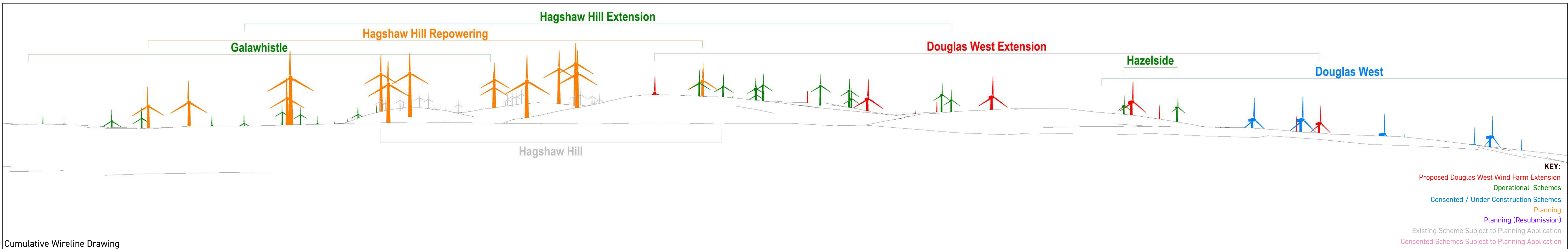
Figure 6.43 (sheet B) Viewpoint 12: East of Glespin (on A70) DOUGLAS WEST WIND FARM EXTENSION