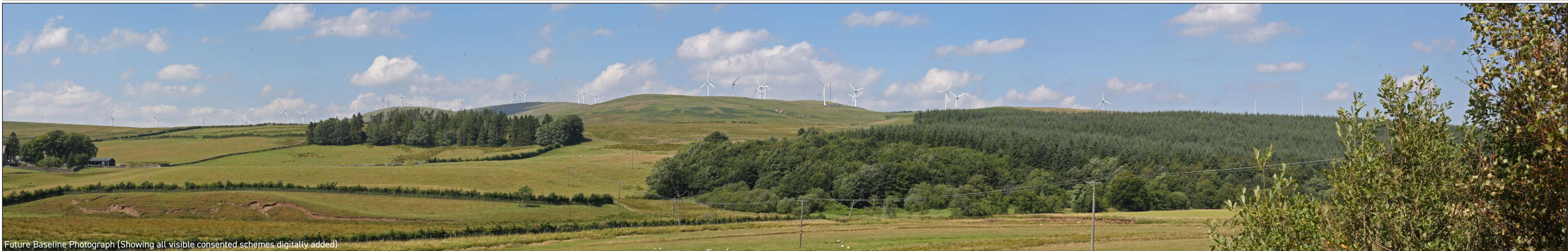
Future Baseline Photograph (Showing all visible consented schemes digitally added)